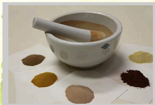
Customized Herbal Solutions